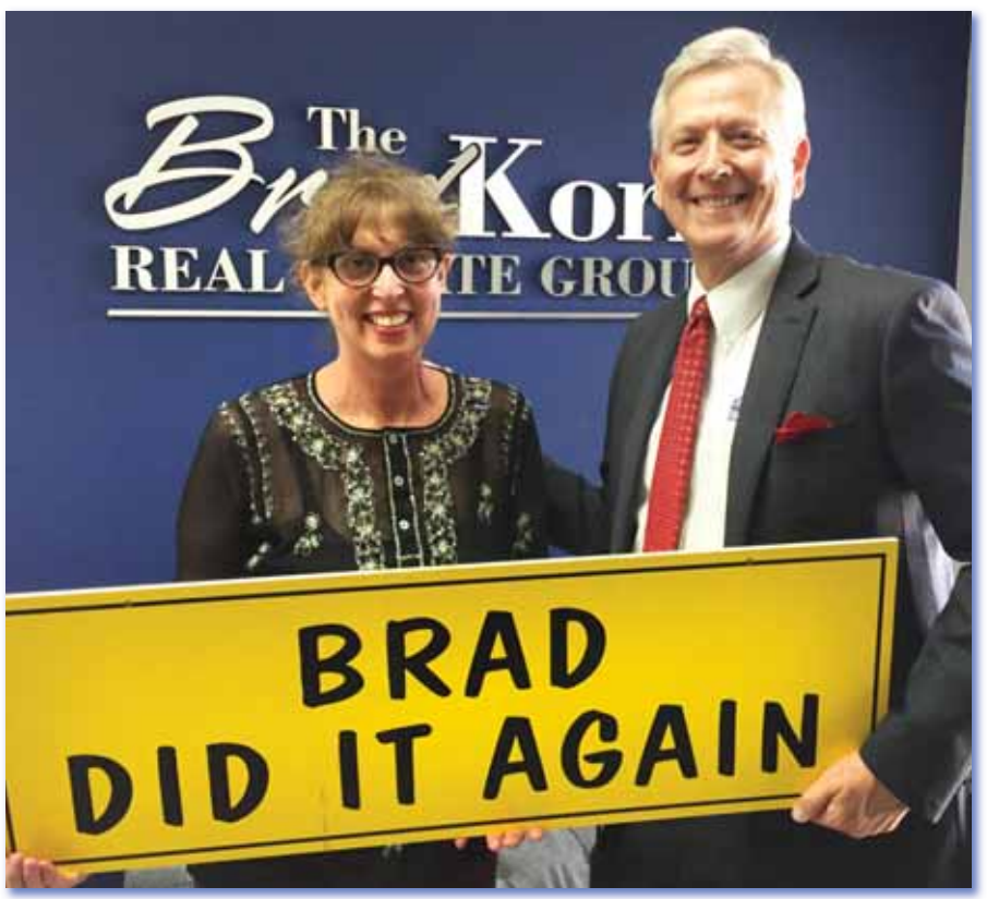
Brad Did It Again with the sale of the Westgate house in Burbank!