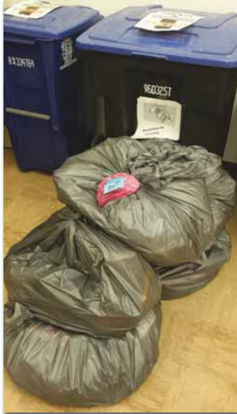
Five plastic bags, carefully filled with recycled eyeglasses, await pick up in the Burbank Central Library. The glasses were dropped off in the three Burbank Library site collection boxes, and comprise more than 1500 pairs of used glasses received by the Burbank Noon Lions for the Lions in Sight project. Used eyeglasses are recycled and provided to meet the ongoing need of the poor in under-developed countries around the world.