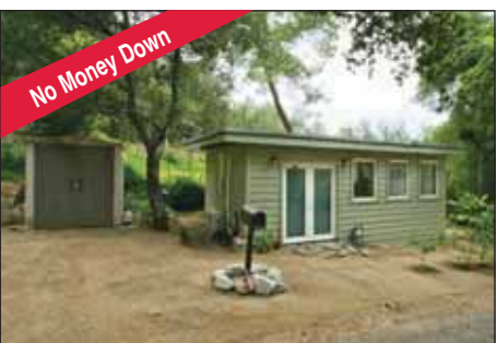
SUNLAND $349,943 Call 1-800-473-0599, Enter Code 3078