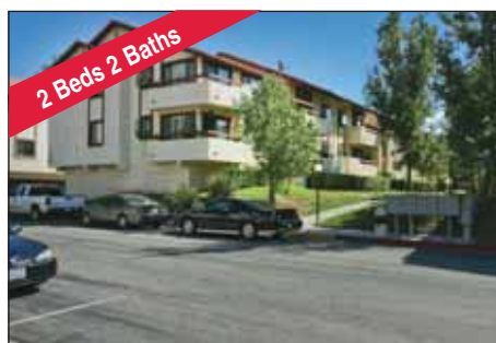
SANTA CLARITA $199,991 Call 1-800-473-0599, Enter Code 2148