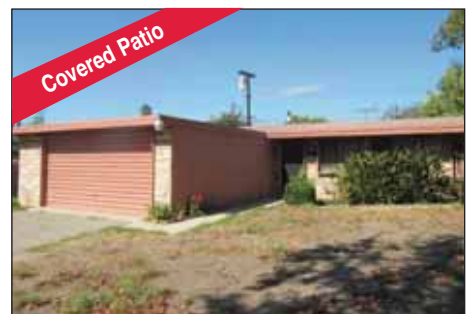
PACOIMA $369,963 Call 1-800-473-0599, Enter Code 2938