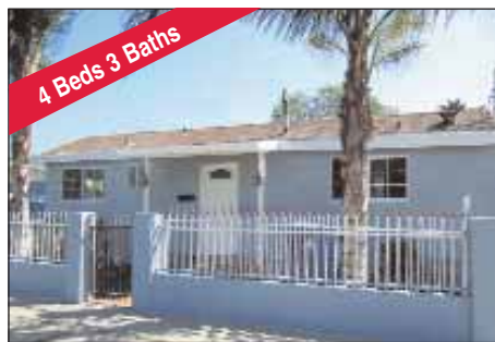
NORTH HOLLYWOOD $399,993 Call 1-800-473-0599, Enter Code 2548