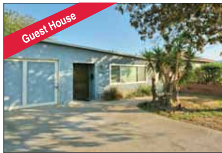
SUN VALLEY $479,974 Call 1-800-473-0599, Enter Code 2678