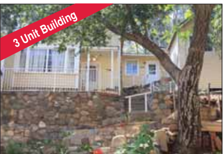
SYLMAR $445,544 Call 1-800-473-0599, Enter Code 2988