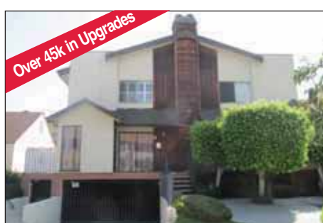
GLENDALE HILLS $424,424 Call 1-800-473-0599, Enter Code 2568