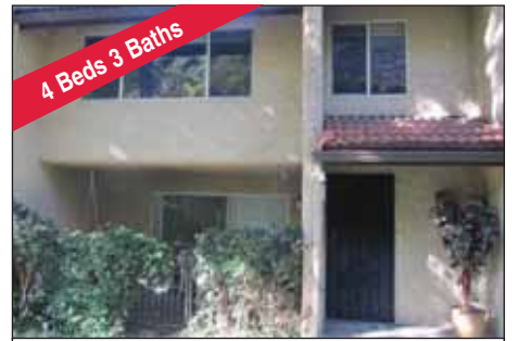
BURBANK $469,964 Call 1-800-473-0599, Enter Code 3188