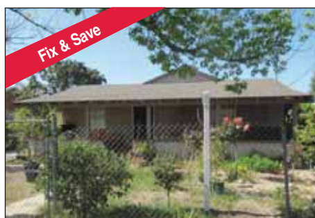
SUN VALLEY $339,933 Call 1-800-473-0599, Enter Code 2588