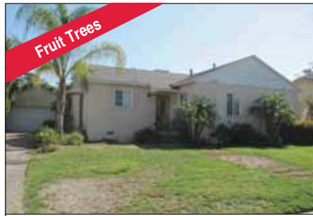
NORTH HOLLYWOOD $479,974 Call 1-800-473-0599, Enter Code 2228