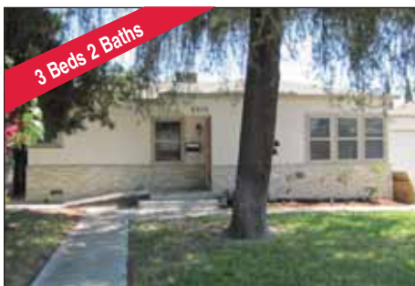
NORTH HOLLYWOOD $497,794 Call 1-800-473-0599, Enter Code 2698

Who said you can't get anything FREE today? All you do is buy or sell your home with us and you can reserve your date to use the truck the day of your closing. If you have a charitable or community project that needs a truck, call us, we'll let them use it FREE!