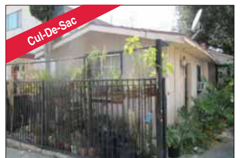
TUJUNGA $189,981 Call 1-800-473-0599, Enter Code 2258