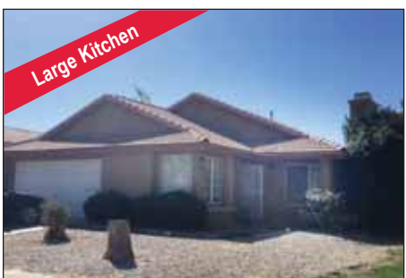
LANCASTER $434,434 Call 1-800-473-0599, Enter Code 3248