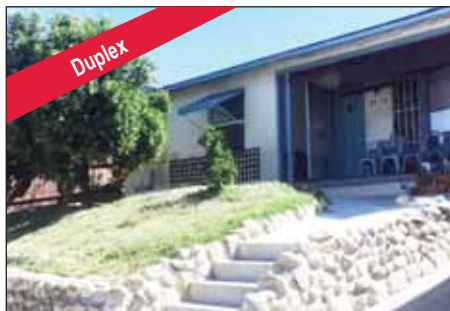
HIGHLAND PARK $719,917 Call 1-800-473-0599, Enter Code 3108