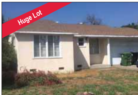
SYLMAR $669,966 Call 1-800-473-0599, Enter Code 3308