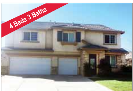
PALMDALE $599,995 Call 1-800-473-0599, Enter Code 3318