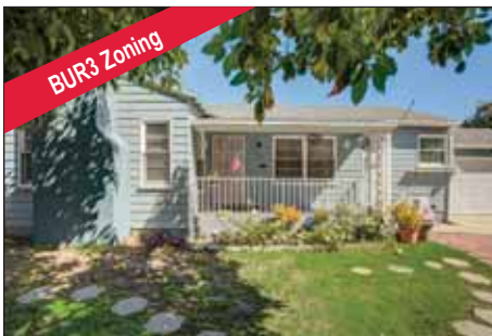
BURBANK $889,988 Call 1-800-473-0599, Enter Code 3258

Who said you can't get anything FREE today? All you do is buy or sell your home with us and you can reserve your date to use the truck the day of your closing. If you have a charitable or community project that needs a truck, call us, we'll let them use it FREE!