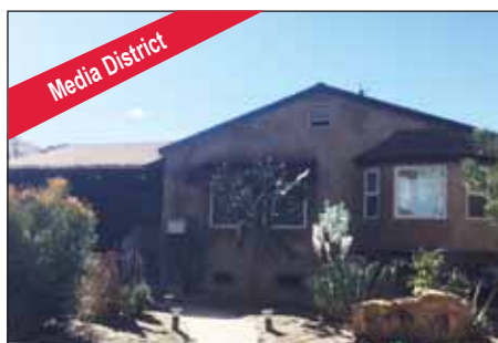
BURBANK $839,938 Call 1-800-473-0599, Enter Code 2598