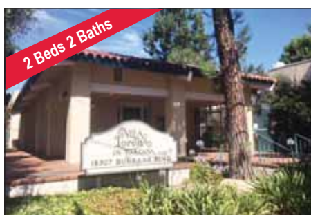
TARZANA $489,984 Call 1-800-473-0599, Enter Code 3158