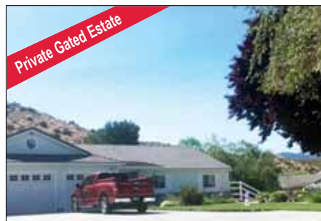
ACTON $849,948 Call 1-800-473-0599, Enter Code 3098