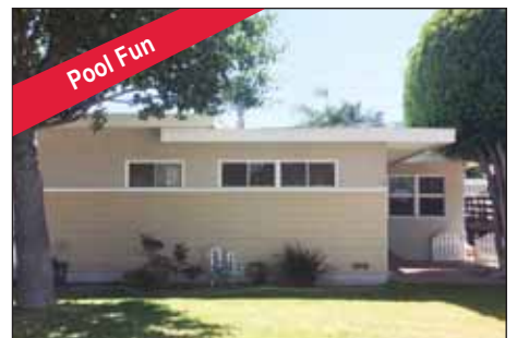
LONG BEACH $799,997 Call 1-800-473-0599, Enter Code 3128