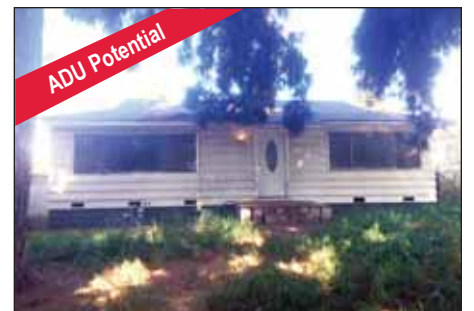
SYLMAR $649,946 Call 1-800-473-0599, Enter Code 3338