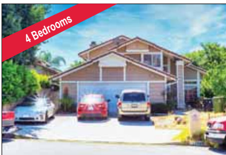
LAKE VIEW TERRACE $799,997 Call 1-800-473-0599, Enter Code 3218