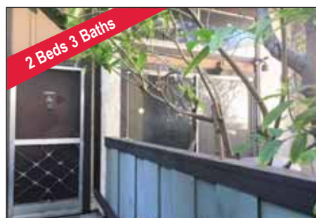
VAN NUYS $549,945 Call 1-800-473-0599, Enter Code 2948